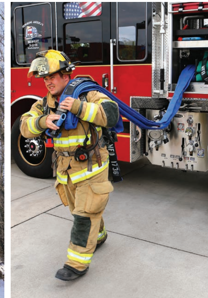
Lower crosslay height for safer and easier hose removal