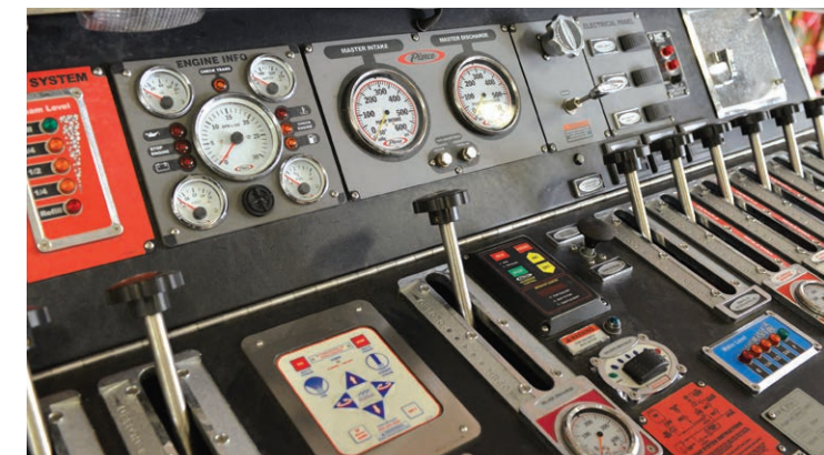
PUC top mount pump panel