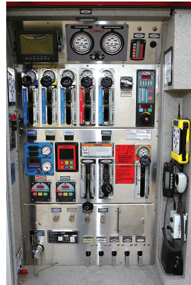
PUC side mount pump panel