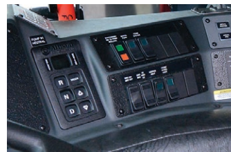
Single-touch water-foam CAFS selection on the dash