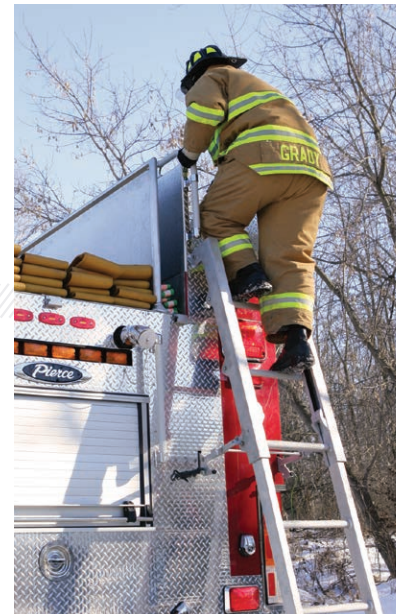
The folding ladder is angled for a safer climb

Safety is built into every product we make – like positioning the pump operator next to hose connections instead of over them. And incorporating chest height crosslays, chest height ladder storage, ladder access to hosebed, 8"-12" lower hosebeds, and stokes/backboard storage that you can reach from the ground.