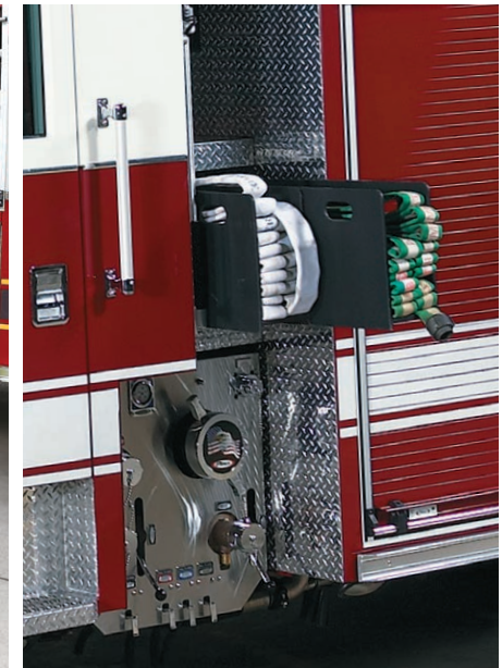
Chest height crosslays