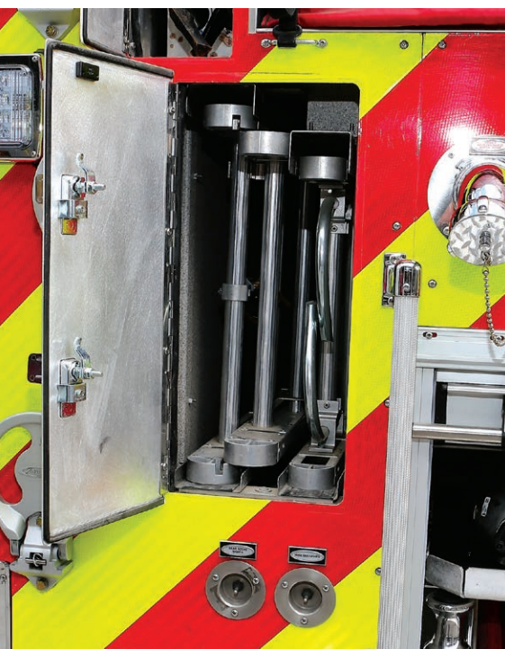
Chest height ladder storage