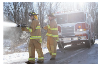
Get true pump and roll as standard

2-step technology reduces shift operations while removing the traditional grinding and uncertainty of putting a traditional mid-ship pump into gear. The park-to-neutral feature places the transmission into neutral automatically when the parking brake is set. The single-touch water-foam CAFS suppression selection located on the dash has the system up and functional before the operator is out of the cab.